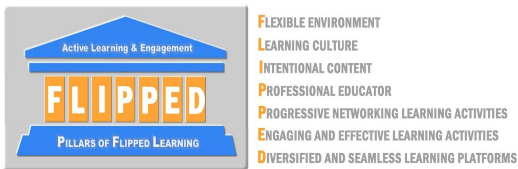
Figure 1. The seven pillars of flipped learning

An interactive online learning community allows students to develop strong relationships with fellow students (Murdock & Williams, 2011). It provides learners with opportunities to meet regularly with their partners for collaborative construction and improvement of knowledge about chosen topics. A great deal of literature suggests that online learning communities are an effective way to promote the sharing and building of knowledge by learners (Ke & Hoedley, 2009), to enhance overall learning and critical thinking, to foster active learning, and to develop more positive learning attitudes, in comparison with conventional classes (Gazi, 2009).